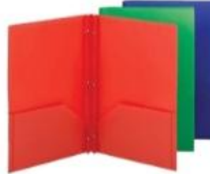
1 Plastic duo tang folder with prongs and pockets