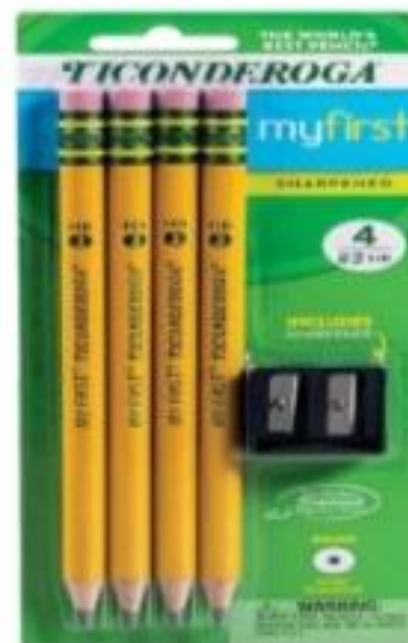
4+ Primary pencils (labeled)