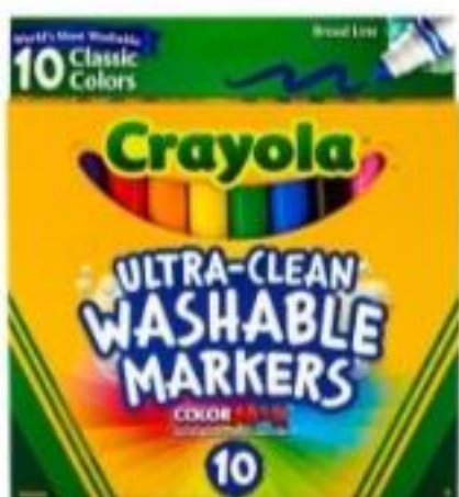
2 packs of crayola Washable Markers (Label box and individual markers )