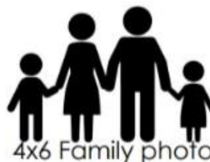
4x6 Family photo