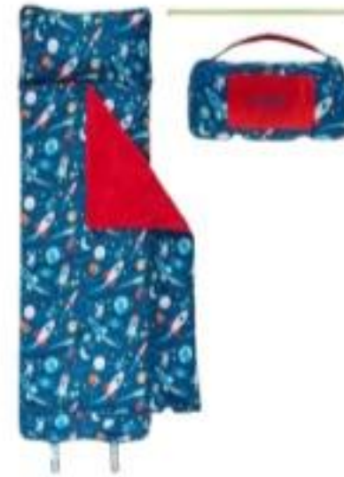
Small blanket (Sent home every Friday)