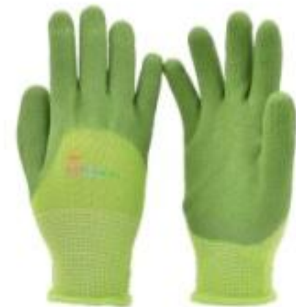
Child size gardening gloves in a ziplock bag (labeled)