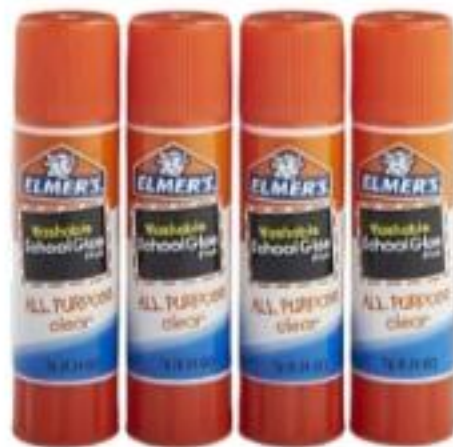
4+ large glue sticks (labeled)