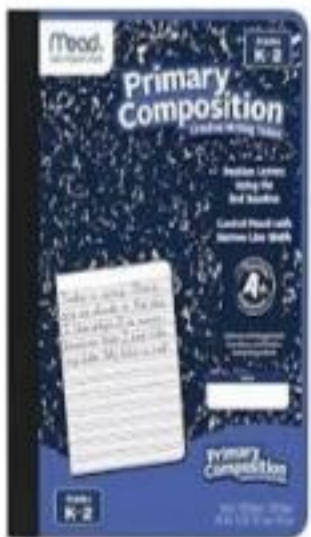
1 composition book (primary)