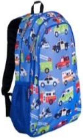
Backpack large enough to hold a 9"X11" Folder no wheels