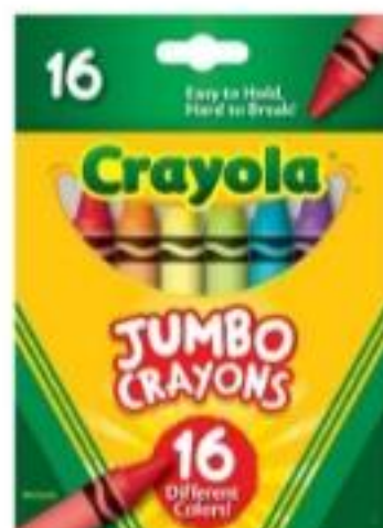
2 packs of crayola jumbo crayons (Label box and individual crayons)