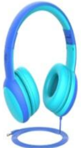
1 set of headphones in a labeled ziplock bag