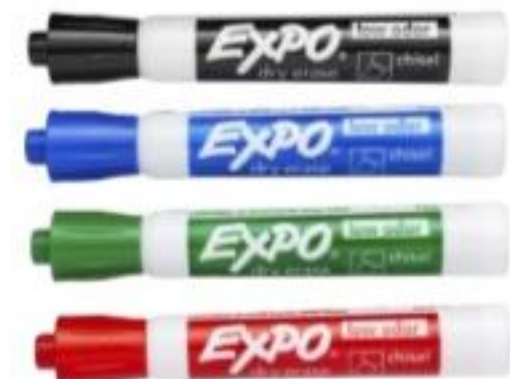
Dry erase markers