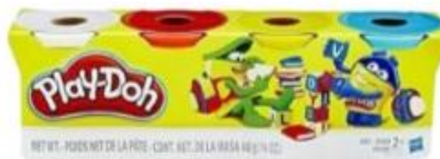
6 tubs of Play-doh brand